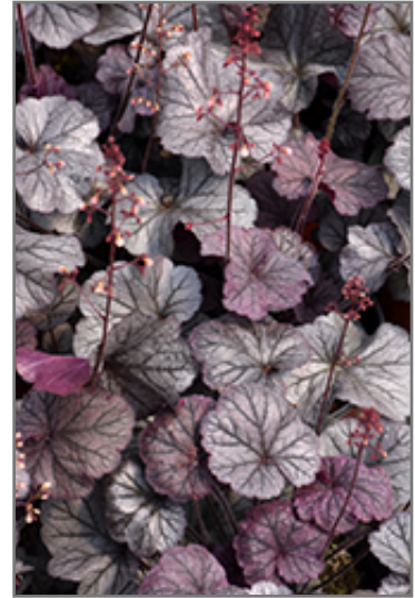
Northern Exposure Silver Coral Bells foliage

This showy garden plant produces silver foliage with deep green veins and burgundy reverses, on a dense, medium size mound; very hardy, with great rust resistance and longevity; excellent for borders, mixed beds, woodland gardens, or as an accent