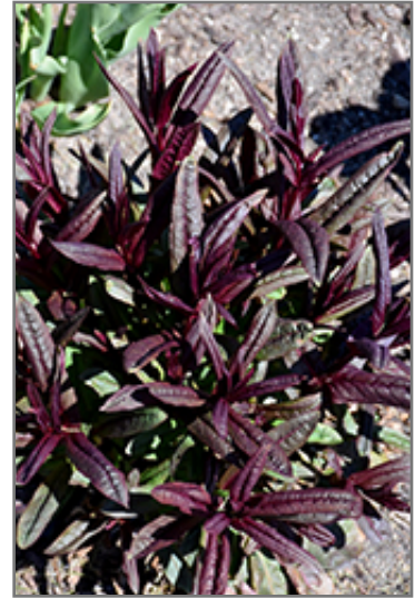
Blackbeard Beard Tongue foliage

Blackbeard Beard Tongue is a fine choice for the garden, but it is also a good selection for planting in outdoor pots and containers. With its upright habit of growth, it is best suited for use as a 'thriller' in the 'spiller-thriller-filler' container combination; plant it near the center of the pot, surrounded by smaller plants and those that spill over the edges. It is even sizeable enough that it can be grown alone in a suitable container. Note that when growing plants in outdoor containers and baskets, they may require more frequent waterings than they would in the yard or garden. Be aware that in our climate, most plants cannot be expected to survive the winter if left in containers outdoors, and this plant is no exception. Contact our experts for more information on how to protect it over the winter months.