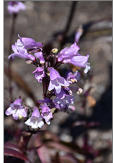
Blackbeard Beard Tongue flowers

Blackbeard Beard Tongue is recommended for the following landscape applications;