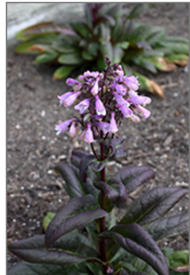
Blackbeard Beard Tongue in bloom