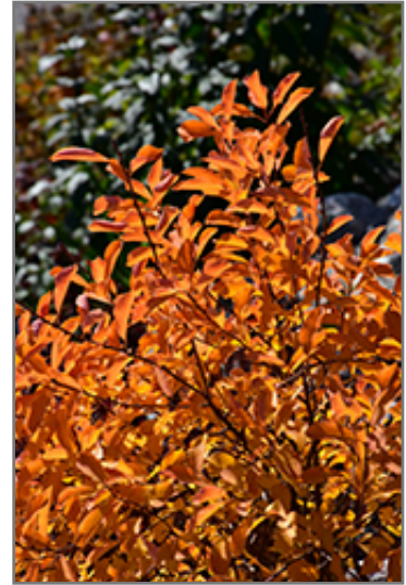
Lotus Moon Pearlbush in fall

This shrub does best in full sun to partial shade. It prefers to grow in average to moist conditions, and shouldn't be allowed to dry out. It is not particular as to soil type, but has a definite preference for acidic soils. It is highly tolerant of urban pollution and will even thrive in inner city environments. This particular variety is an interspecific hybrid.