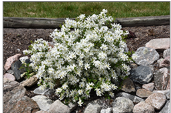
Lotus Moon Pearlbusch in bloom