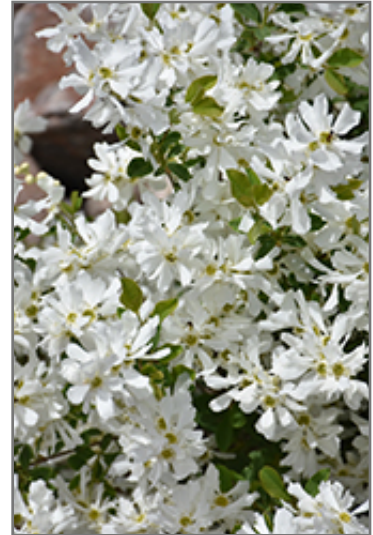
Lotus Moon Pearlbusch flowers