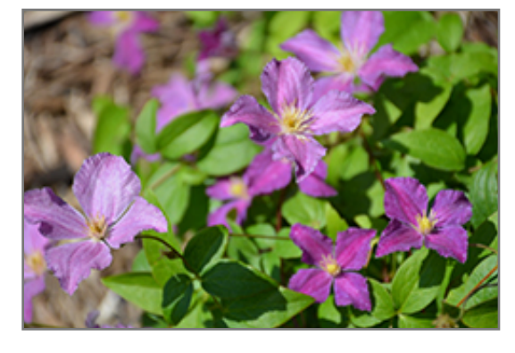
Jolly Good Clematis flowers