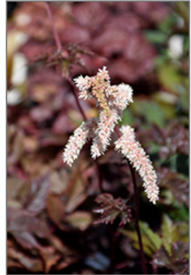
Chocolate Shogun Astilbe flowers

Chocolate Shogun Astilbe is recommended for the following landscape applications;