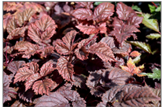
Chocolate Shogun Astilbe foliage