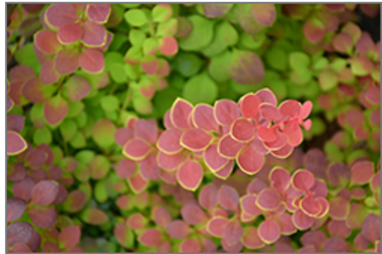
Sunjoy Tangelo Japanese Barberry foliage