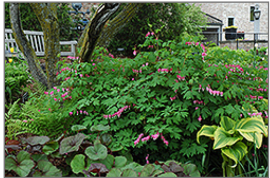
Common Bleeding Heart in bloom