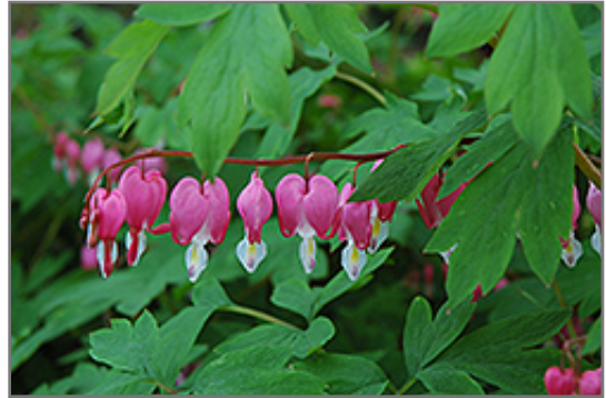
Common Bleeding Heart flowers