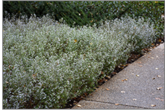
Dwarf Calamint in bloom

Dwarf Calamint is recommended for the following landscape applications;