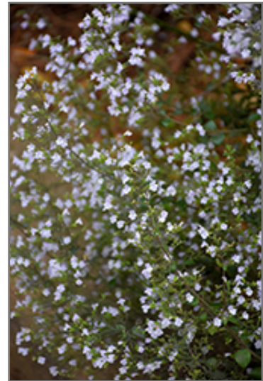
Dwarf Calamint flowers