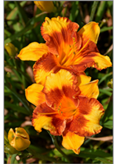
Adorable Tiger Daylily flowers