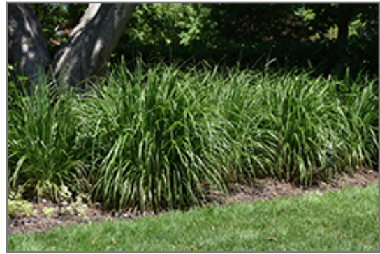
Korean Reed Grass

Korean Reed Grass is recommended for the following landscape applications;