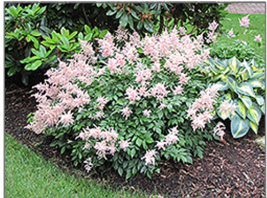
Peach Blossom Astilbe in bloom