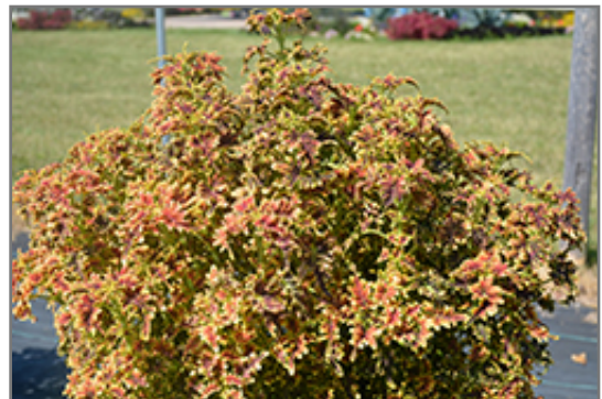
Under The Sea Copper Coral Coleus