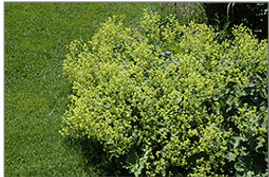
Lady's Mantle in bloom