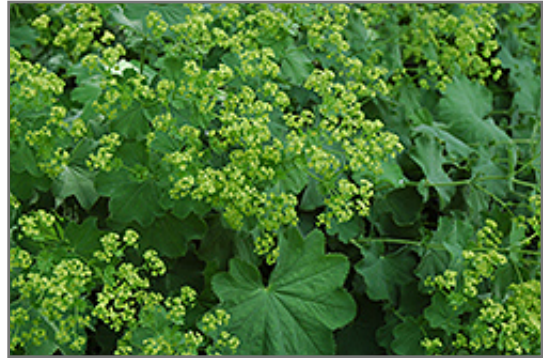
Lady's Mantle flowers

Lady's Mantle is recommended for the following landscape applications;