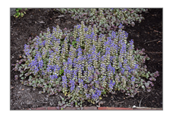
Burgundy Glow Bugleweed in bloom

Burgundy Glow Bugleweed is a fine choice for the garden, but it is also a good selection for planting in outdoor containers and hanging baskets. Because of its spreading habit of growth, it is ideally suited for use as a 'spiller' in the 'spiller-thriller-filler' container combination; plant it near the edges where it can spill gracefully over the pot. Note that when growing plants in outdoor containers and baskets, they may require more frequent waterings than they would in the yard or garden. Be aware that in our climate, most plants cannot be expected to survive the winter if left in containers outdoors, and this plant is no exception. Contact our experts for more information on how to protect it over the winter months.