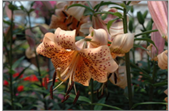
Splendens Tiger Lily flowers