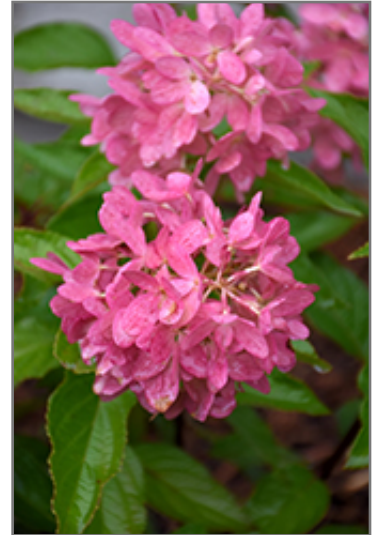
Zinfin Doll Hydrangea flowers (faded)

This shrub performs well in both full sun and full shade. It prefers to grow in average to moist conditions, and shouldn't be allowed to dry out. It is not particular as to soil type or pH. It is highly tolerant of urban pollution and will even thrive in inner city environments. Consider applying a thick mulch around the root zone in winter to protect it in exposed locations or colder microclimates. This is a selected variety of a species not originally from North America.