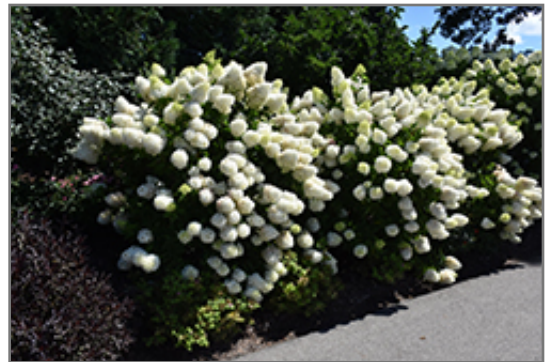
Zinfin Doll Hydrangea in bloom