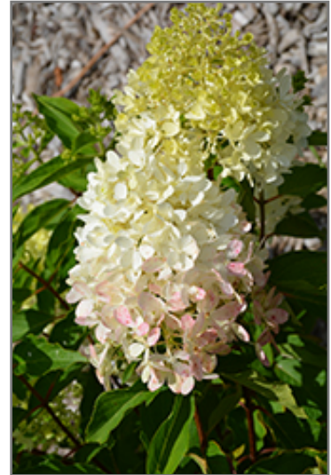
Zinfin Doll Hydrangea flowers