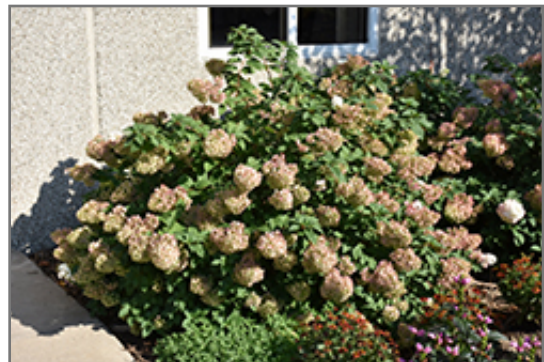
Strawberry Sundae Hydrangea in bloom