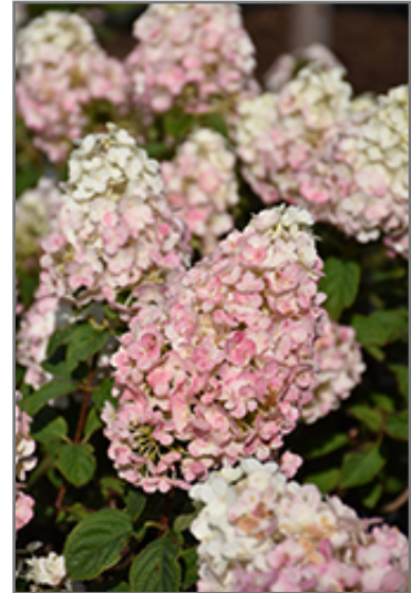
Strawberry Sundae Hydrangea flowers