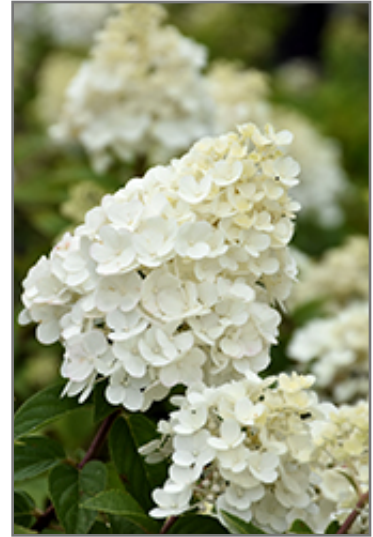
Strawberry Sundae Hydrangea flowers

Strawberry Sundae Hydrangea makes a fine choice for the outdoor landscape, but it is also well-suited for use in outdoor pots and containers. With its upright habit of growth, it is best suited for use as a 'thriller' in the 'spiller-thriller-filler' container combination; plant it near the center of the pot, surrounded by smaller plants and those that spill over the edges. It is even sizeable enough that it can be grown alone in a suitable container. Note that when grown in a container, it may not perform exactly as indicated on the tag - this is to be expected. Also note that when growing plants in outdoor containers and baskets, they may require more frequent waterings than they would in the yard or garden. Be aware that in our climate, most plants cannot be expected to survive the winter if left in containers outdoors, and this plant is no exception. Contact our experts for more information on how to protect it over the winter months.