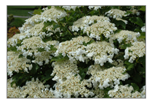
Bailey Compact Highbush Cranberry flowers

8785 Green Lake Trail Forest Lake, MN 55025 651-462-5554