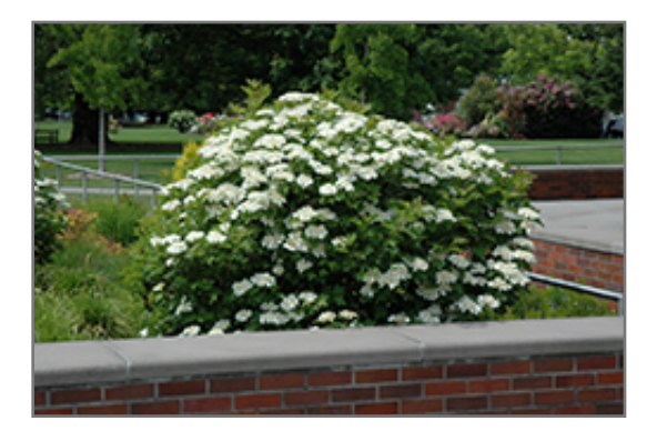
Bailey Compact Highbush Cranberry in bloom

Bailey Compact Highbush Cranberry is a dense multi-stemmed deciduous shrub with an upright spreading habit of growth. Its average texture blends into the landscape, but can be balanced by one or two finer or coarser trees or shrubs for an effective composition.