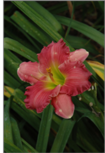
Passionate Returns Daylily flowers