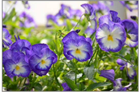
Halo Lilac Pansy flowers