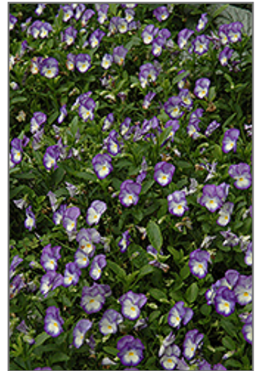
Halo Lilac Pansy flowers