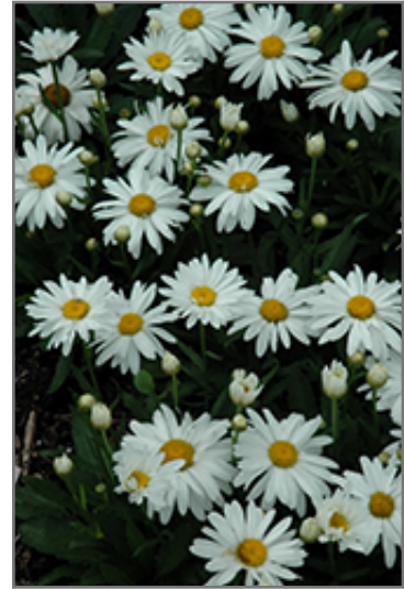
Whoops-A-Daisy Shasta Daisy flowers