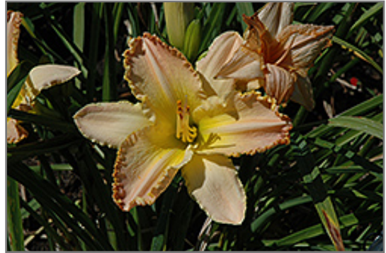
Pizza Crust Daylily flowers