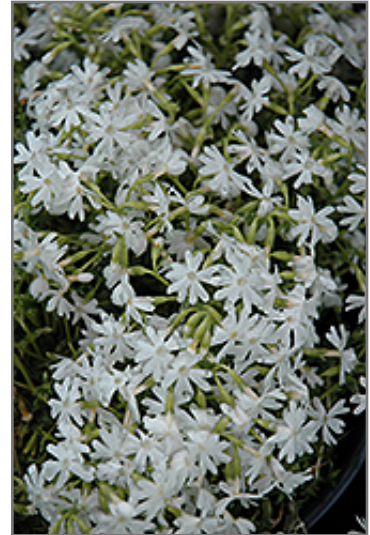
Snowflake Phlox flowers

This variety produces a showy carpet of bright white flowers shining in the spring sun; prune lightly after flowering to encourage a dense growth habit; wonderful for rock gardens, edging, or in mixed containers