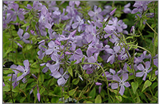
London Grove Blue Phlox flowers