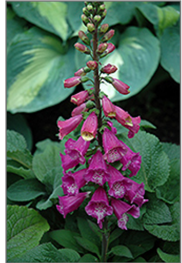
Candy Mountain Foxglove flowers

Unique, upward facing flowers of violet-rose with white interiors and dark purple spots; tall spikes rise above attractive green oblong shaped leaves; a biennial that's happiest in part shade with adequate moisture