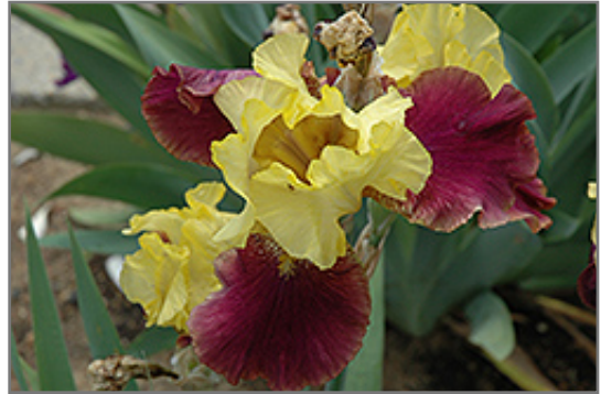
Blatant Iris flowers