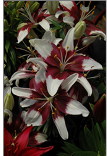
Lily Looks Tiny Padhye Lily flowers