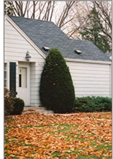
Upright Japanese Yew