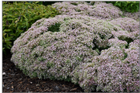
Rock 'N Round Pure Joy Stonecrop in bloom

This is a relatively low maintenance plant, and is best cleaned up in early spring before it resumes active growth for the season. It is a good choice for attracting bees and butterflies to your yard, but is not particularly attractive to deer who tend to leave it alone in favor of tastier treats. It has no significant negative characteristics.