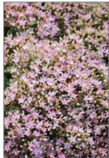
Rock 'N Round Pure Joy Stonecrop flowers