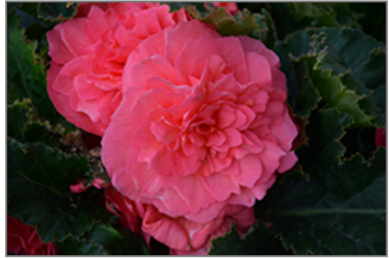
Nonstop Pink Begonia flowers

Nonstop Pink Begonia is recommended for the following landscape applications;