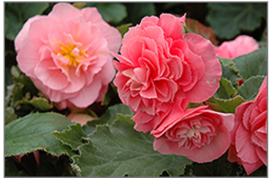
Nonstop Pink Begonia flowers