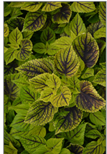
Gays Delight Coleus foliage