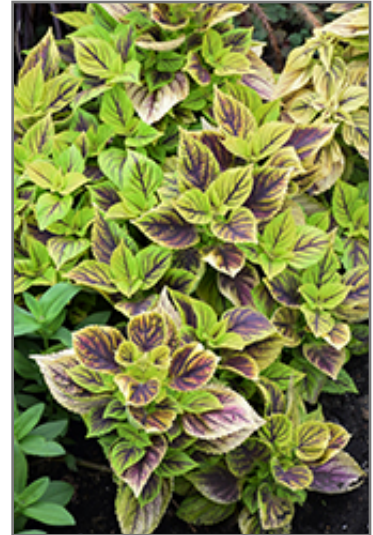
Gays Delight Coleus