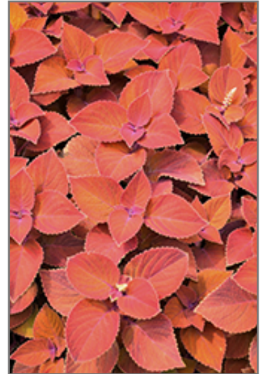
ColorBlaze Sedona Sunset Coleus foliage