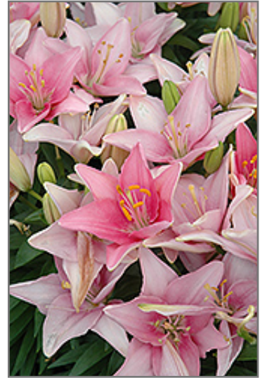
Lily Looks Tiny Icon Lily flowers