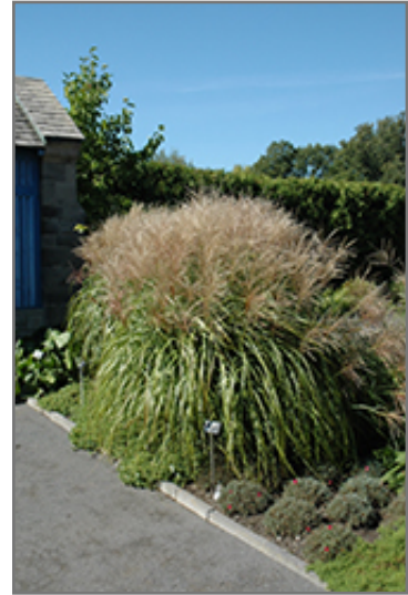
Huron Sunrise Maiden Grass

Huron Sunrise Maiden Grass is recommended for the following landscape applications;