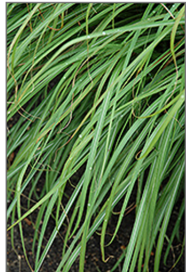
Huron Sunrise Maiden Grass foliage