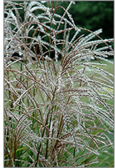
Huron Sunrise Maiden Grass flowers

This plant does best in full sun to partial shade. It prefers to grow in average to moist conditions, and shouldn't be allowed to dry out. It is not particular as to soil type or pH. It is highly tolerant of urban pollution and will even thrive in inner city environments. This is a selected variety of a species not originally from North America. It can be propagated by division; however, as a cultivated variety, be aware that it may be subject to certain restrictions or prohibitions on propagation.