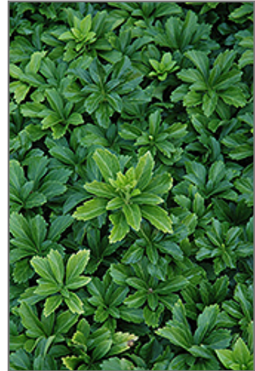
Green Sheen Japanese Spurge foliage