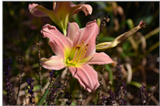
Bama Music Daylily flowers