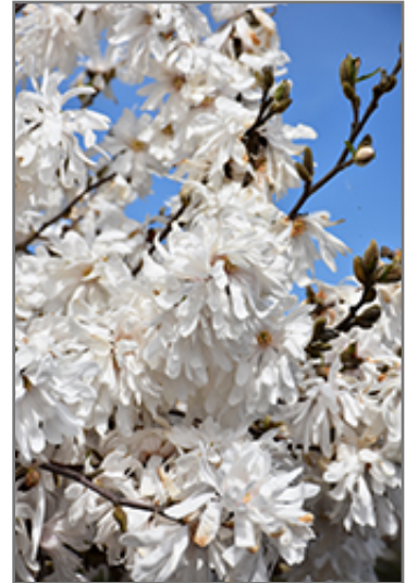
Royal Star Magnolia flowers