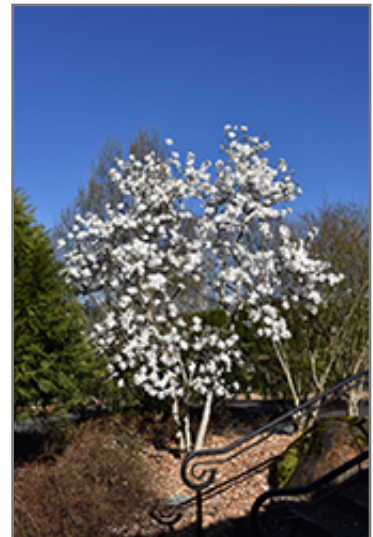
Royal Star Magnolia in bloom