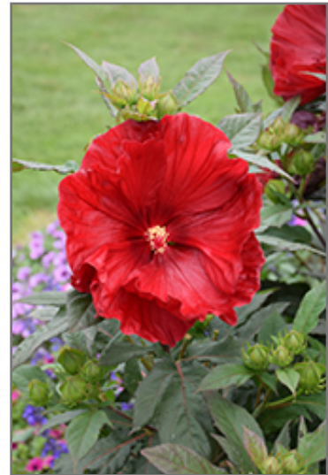
Summerific Cranberry Crush Hibiscus flowers