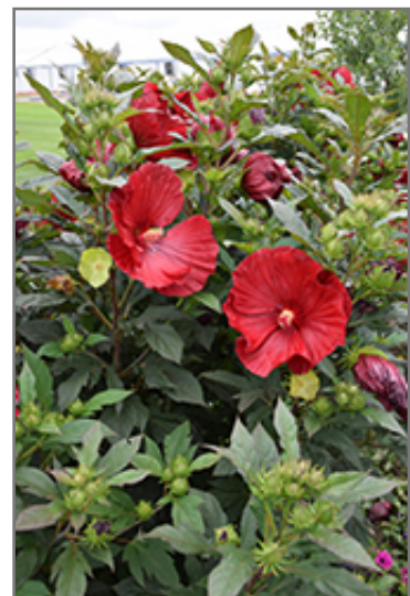
Summerific Cranberry Crush Hibiscus flowers