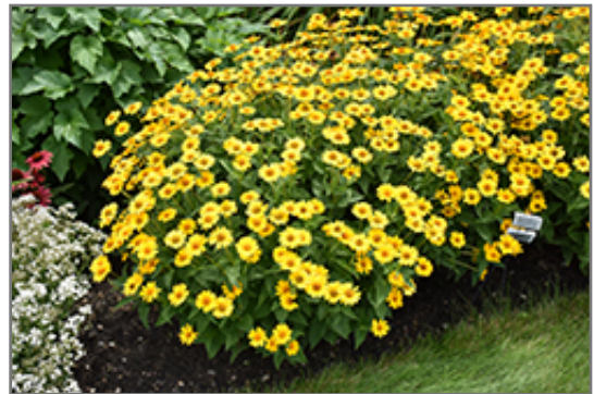
Tuscan Sun False Sunflower in bloom