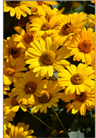
Tuscan Sun False Sunflower flowers

Tuscan Sun False Sunflower is recommended for the following landscape applications;