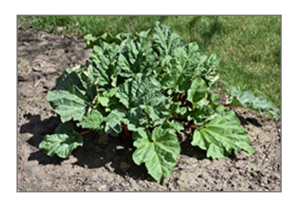
Chipman Red Rhubarb