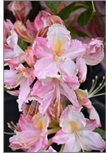
Tri-Lights Azalea flowers