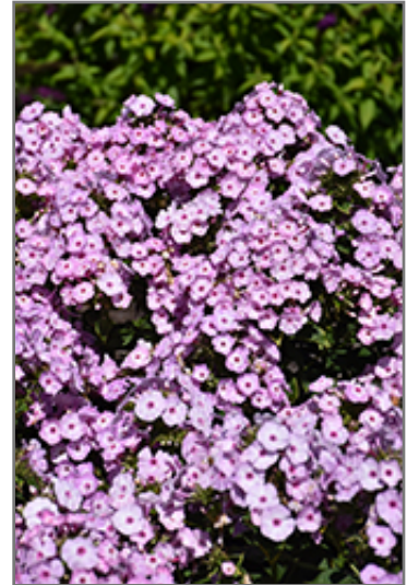
Garden Girls Fancy Girl Garden Phlox flowers

Elegant summer blooms of fragrant, soft pink flowers with darker rose-pink centers surrounded by white halos, on tall plants; suitable for containers or small perennial borders; excellent mildew resistance