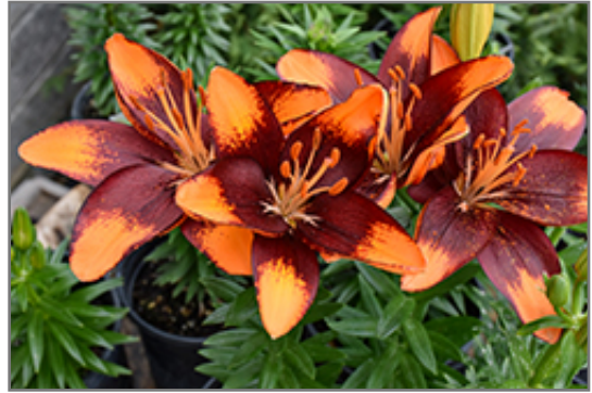
Lily Looks Tiny Lion Lily flowers