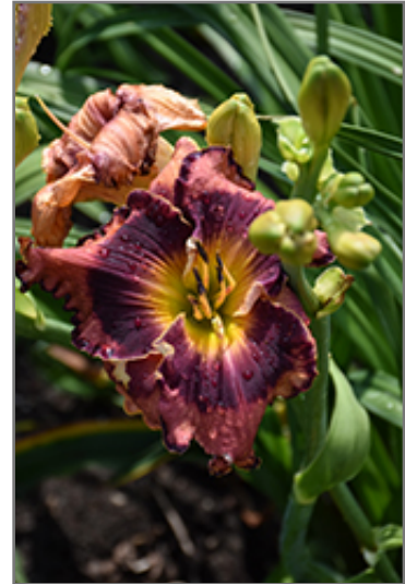
The Band Played On Daylily flowers