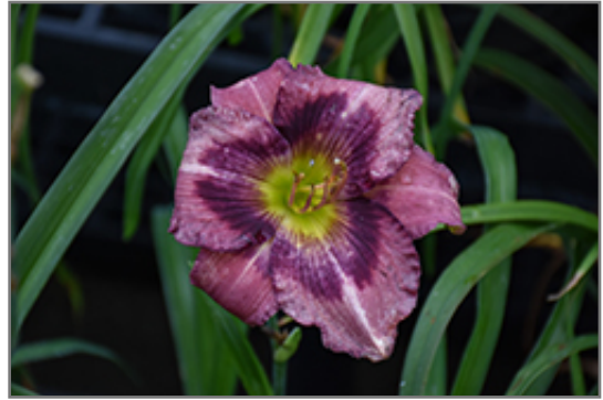
Kansas Kitten Daylily flowers