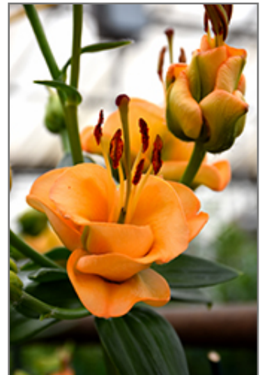
Apricot Fudge Lily flowers