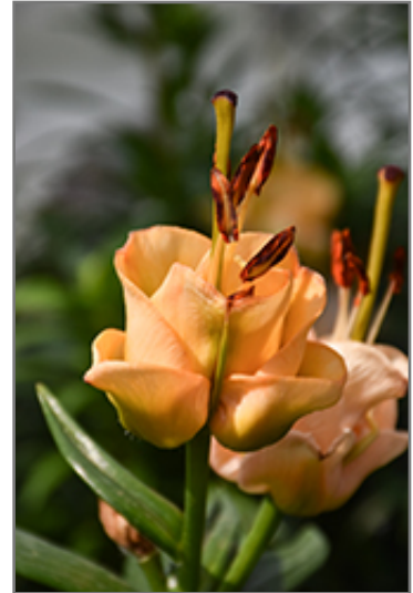
Apricot Fudge Lily flowers

Apricot Fudge Lily is recommended for the following landscape applications;