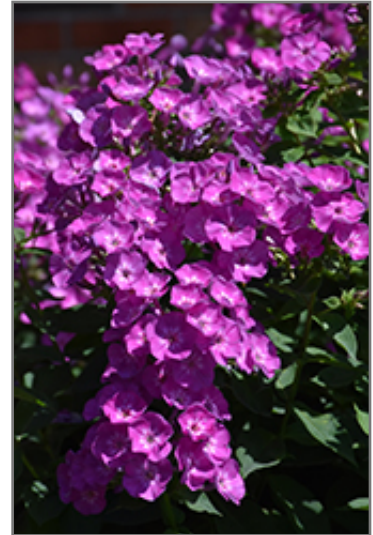
Garden Girls Dream Girl Garden Phlox flowers

Garden Girls Dream Girl Garden Phlox is recommended for the following landscape applications;