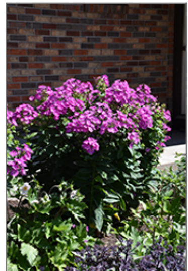
Garden Girls Dream Girl Garden Phlox in bloom