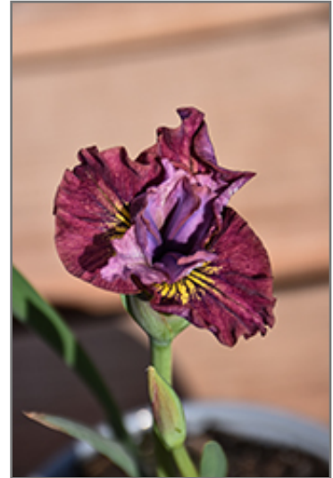
Miss Apple Siberian Iris flowers

Miss Apple Siberian Iris will grow to be about 24 inches tall at maturity, with a spread of 18 inches. When grown in masses or used as a bedding plant, individual plants should be spaced approximately 14 inches apart. It grows at a medium rate, and under ideal conditions can be expected to live for approximately 10 years. As an herbaceous perennial, this plant will usually die back to the crown each winter, and will regrow from the base each spring. Be careful not to disturb the crown in late winter when it may not be readily seen!