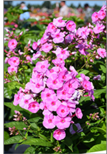
Luminary Prismatic Pink Tall Garden Phlox flowers