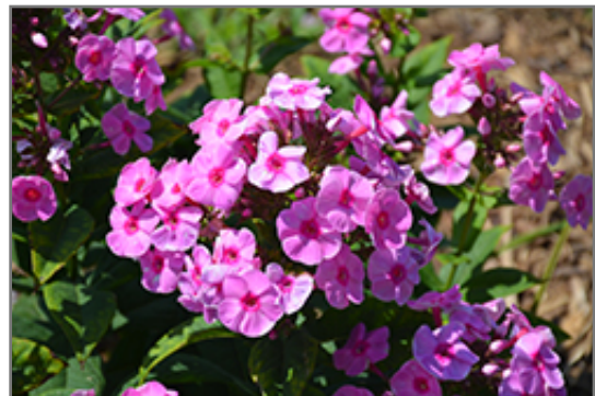
Luminary Prismatic Pink Tall Garden Phlox flowers