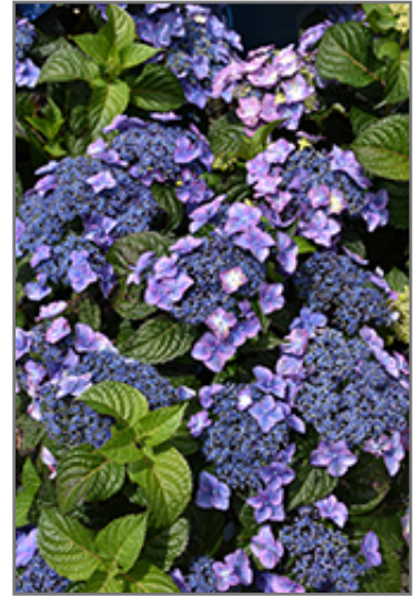
Pop Star Hydrangea flowers

Pop Star Hydrangea is recommended for the following landscape applications;