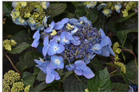
Pop Star Hydrangea flowers